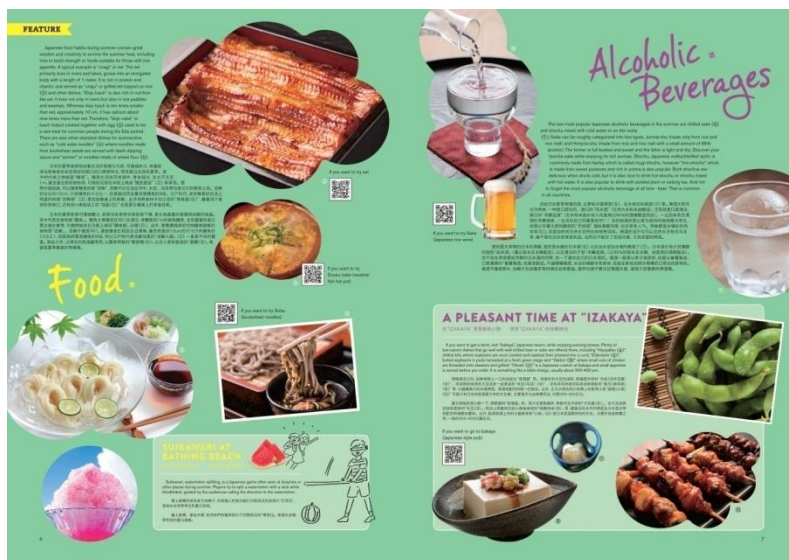
▲ Image of the special pages

<Contact information for inquiries about this press letter>